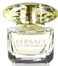
Versace Yellow Diamond