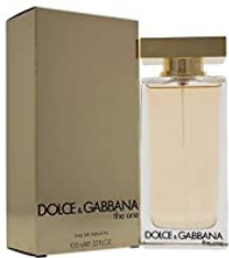
Dolce & Gabbana The One