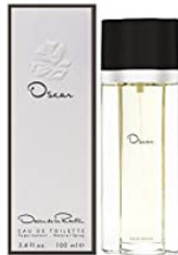
Oscar by Oscar De La Renta