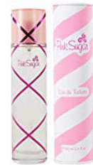
Aqualina Pink Sugar