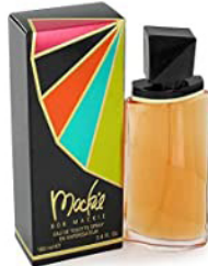
Mackie by Bob Mackie