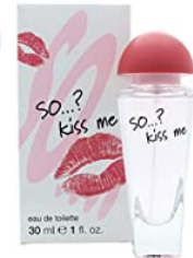
So? Kiss Me